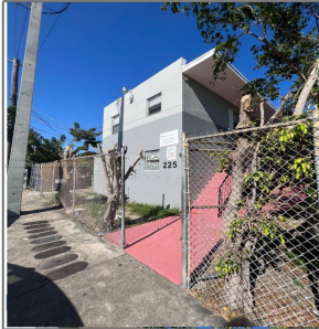
South Elevation - Street