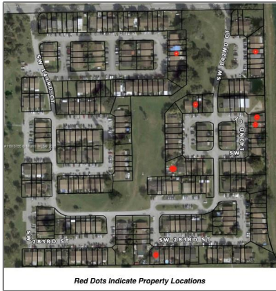
Red Dots Indicate Property Locations