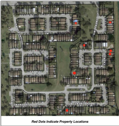
Red Dots Indicate Property Locations