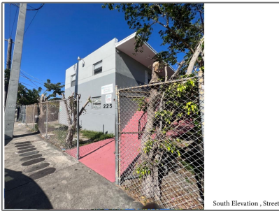
South Elevation , Street